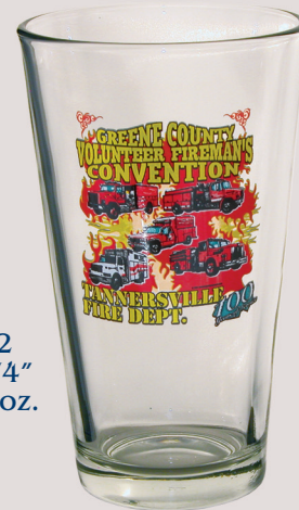
DG-16 5 3/4" 16 oz.