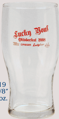
P-19 6 3/8" 19 oz.