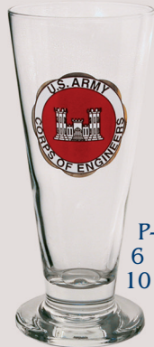
P-10 6 1/2" 10 oz.