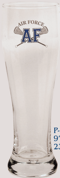
P-23 9" 23 oz.