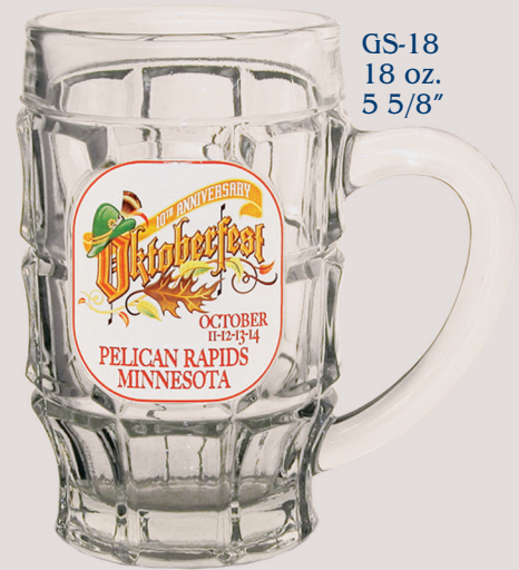
GS-18 18 oz. 5 5/8"