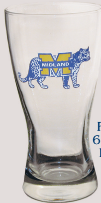
P-12 6 1/4" 13 oz.