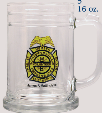
GT-16 5" 16 oz.