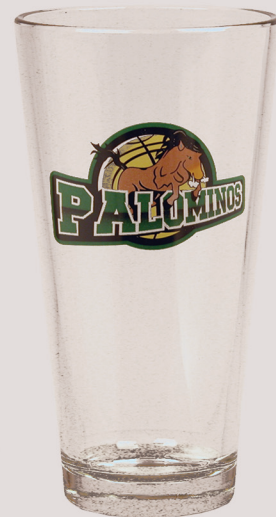
DG-20 6 3/4" 20 oz.