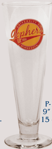
P-16 9" 15 oz.