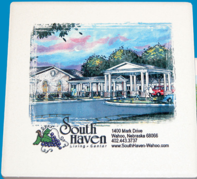
Standard Imprint Area