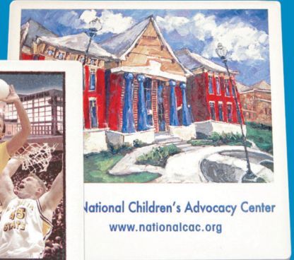
National Children's Advocacy Center www.nationalcac.org