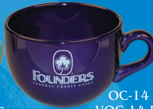
OC-14 DB VOC-14 DB